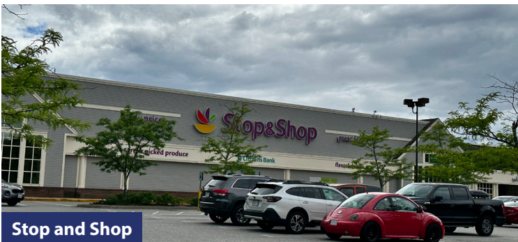
Stop and Shop