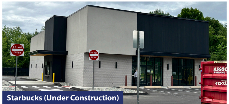
Starbucks (Under Construction)