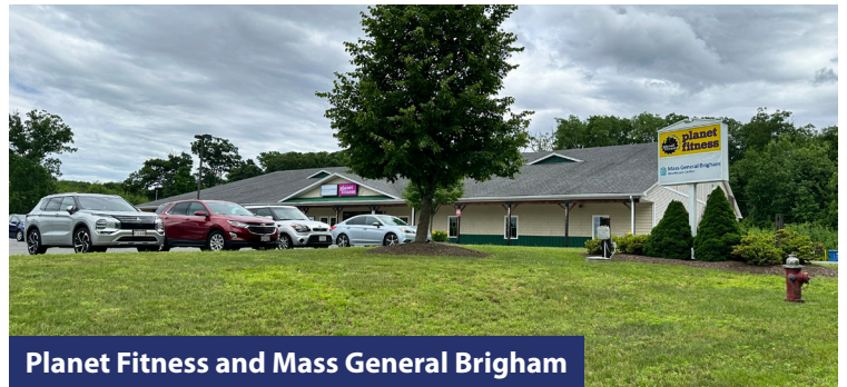
Planet Fitness and Mass General Brigham